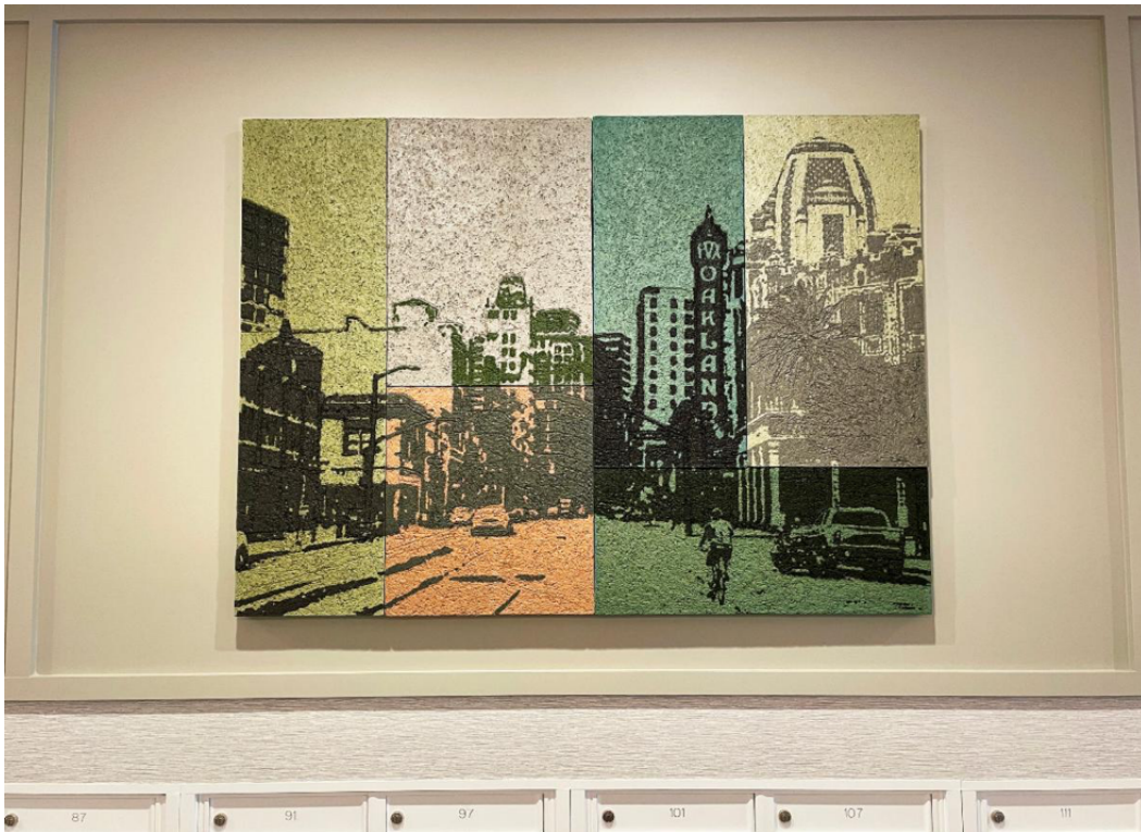
Artwork by Kwadwo Otempong

Many works such as the one above by Kwadwo Otempong , were selected or created with the site and Oakland context in mind. Otempong's materials are recycled pulped cardboard, pigment, and glue on canvas, creating a dynamic work that stands out among the collection.