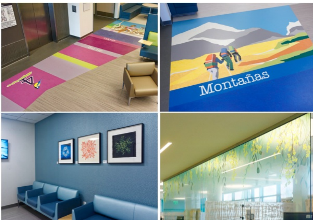
Artworks by t.w.five, Dharma Strasser MacColl, and Ivy Jacobsen

CC/AA helped select, commission, place and install over 900 artworks, including nearly 400 new framed pieces, architecturally integrated works, and custom decals; over 460 painted canvases created especially for PCMB by patients and staff; and approximately 50 artworks relocated from UCSF's prominent collection. Additionally, CC/AA assisted in the selection, acquisition and placement of over 50 photo-based super graphics and art images printed on ceiling tiles. We are grateful to all the artists who contributed their beautiful and inspiring works to this special collection.